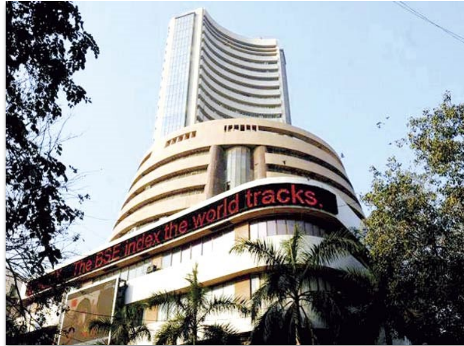
Bombay Stock Exchange