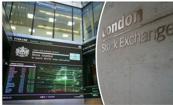
London Stock Exchange