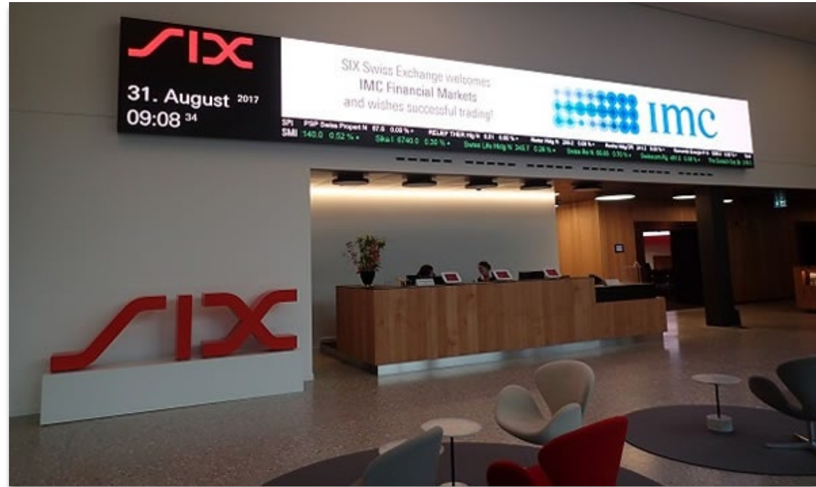
SIX Swiss Exchange