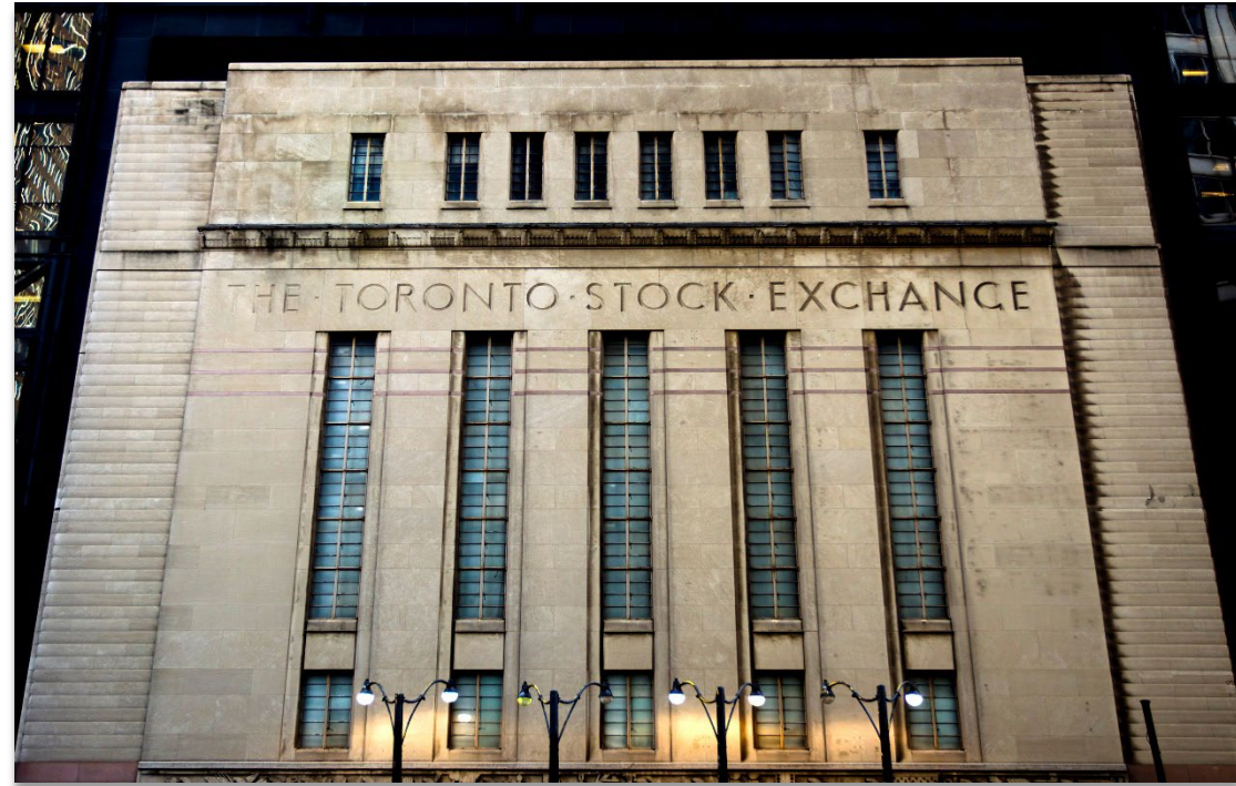
Toronto Stock Exchange