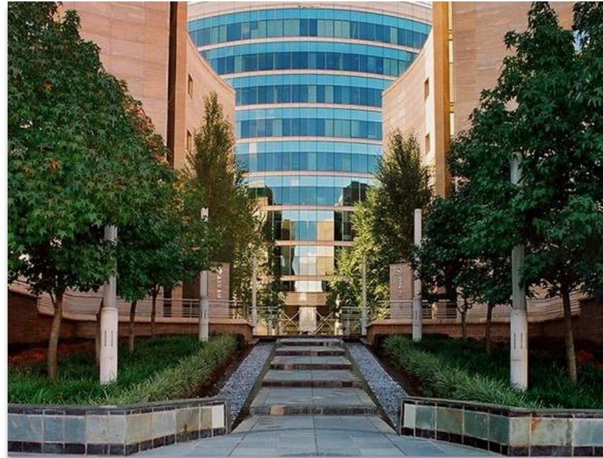
Johannesburg Stock Exchange