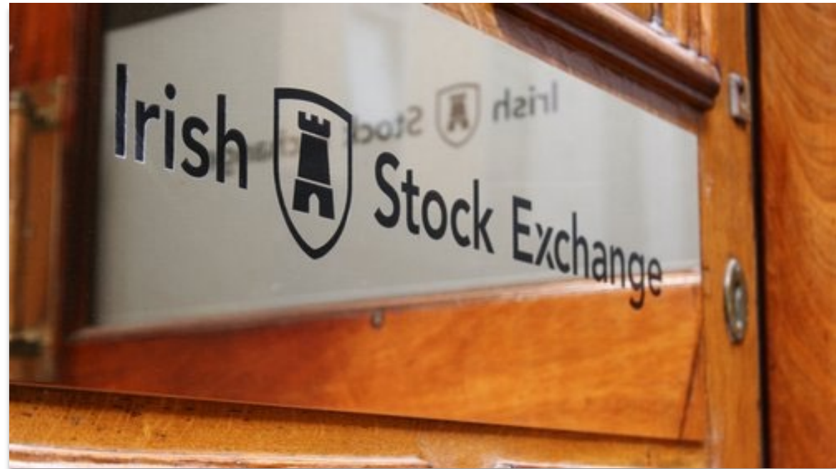
Irish Stock Exchange