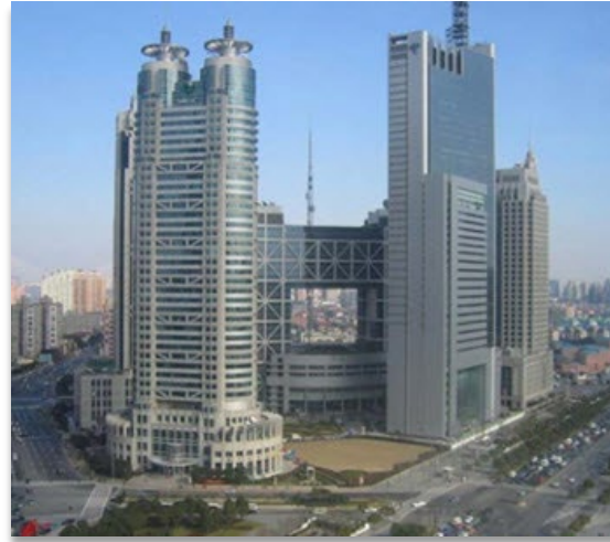
Shanghai Stock Exchange