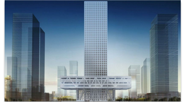
Shenzhen Stock Exchange