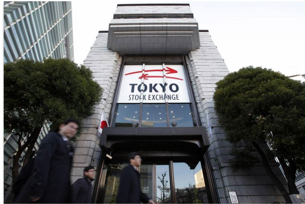
Japan Exchange Group / Tokyo Stock Exchange