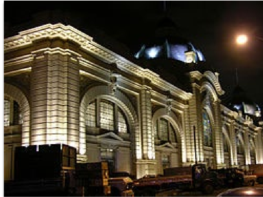
B3 Stock Exchange