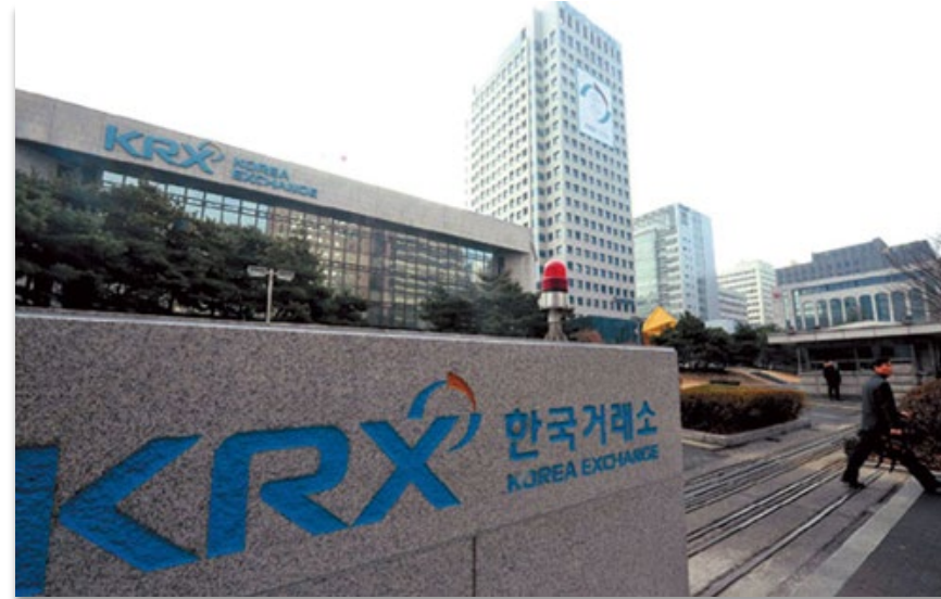
KRX - Korea Exchange