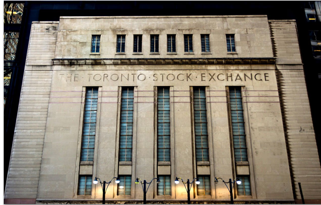
Toronto Stock Exchange