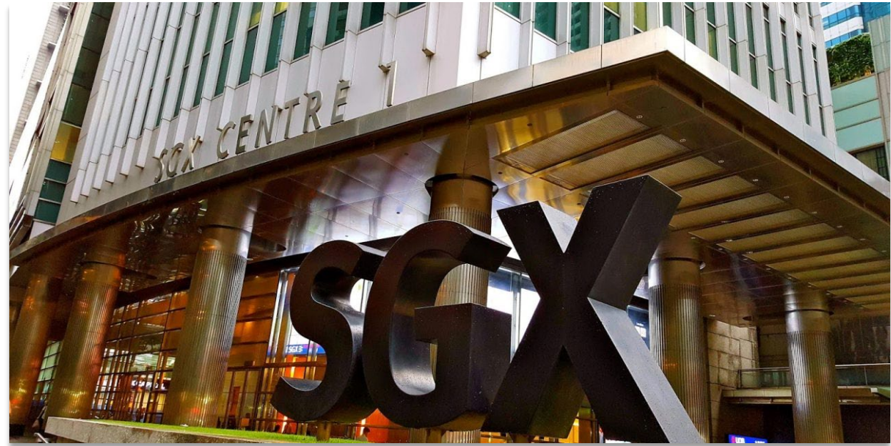
Singapore Stock Exchange